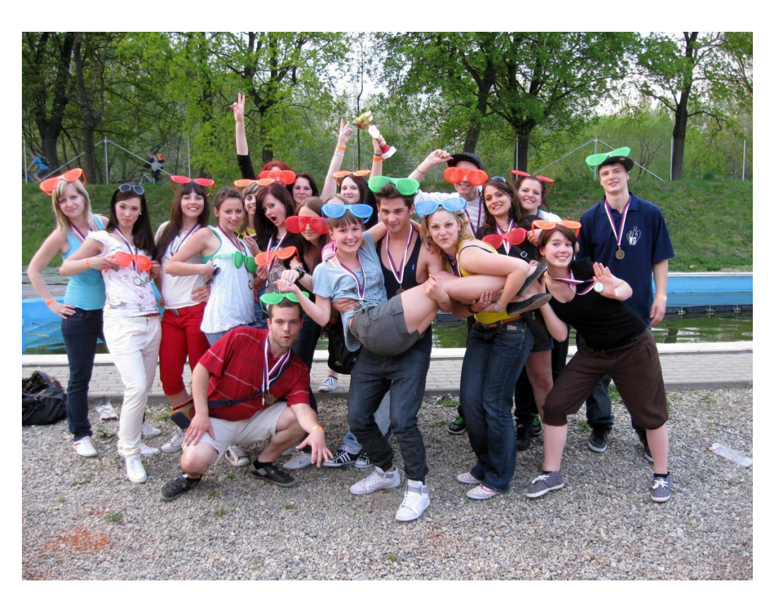
Figure nr. 45 N-yoj Romeo a Julie 2011