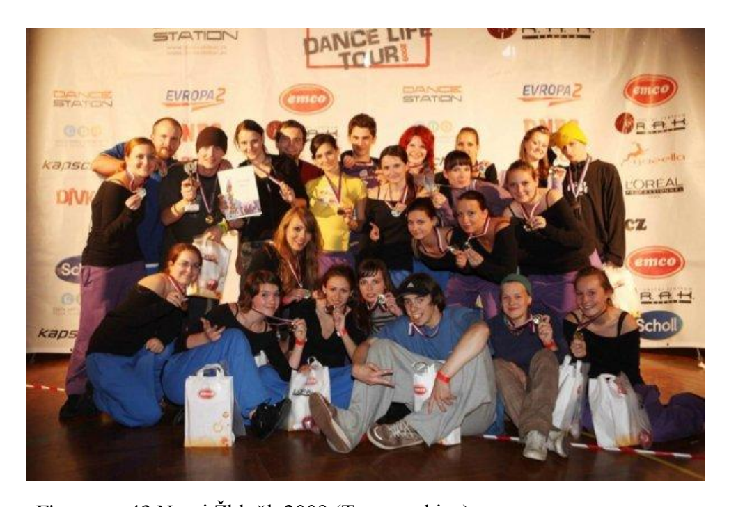
Figure nr. 43 N-yoj Žbluňk 2009 (Team archive)