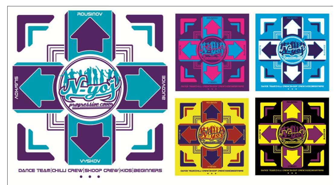
Figure nr. 36 Promo T-shirt (M brijo)

N-yoj prepares new project with M brijo. The purpose of this cooperation is to create fan shirts with the brand name. If one wants to be "visible" he or she has to be able to "make them selves visible". The increase of promotion enhances the opportunity to get sponsors. Sponsoring goes hand in hand with marketing. Through successful marketing the team can attract sponsors' attention and make them feel that it is worthy to invest in the team. More money available for the team organisation would result in more quality.