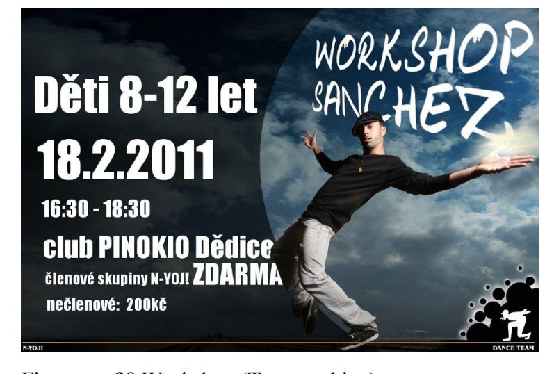
Figure nr. 30 Workshop