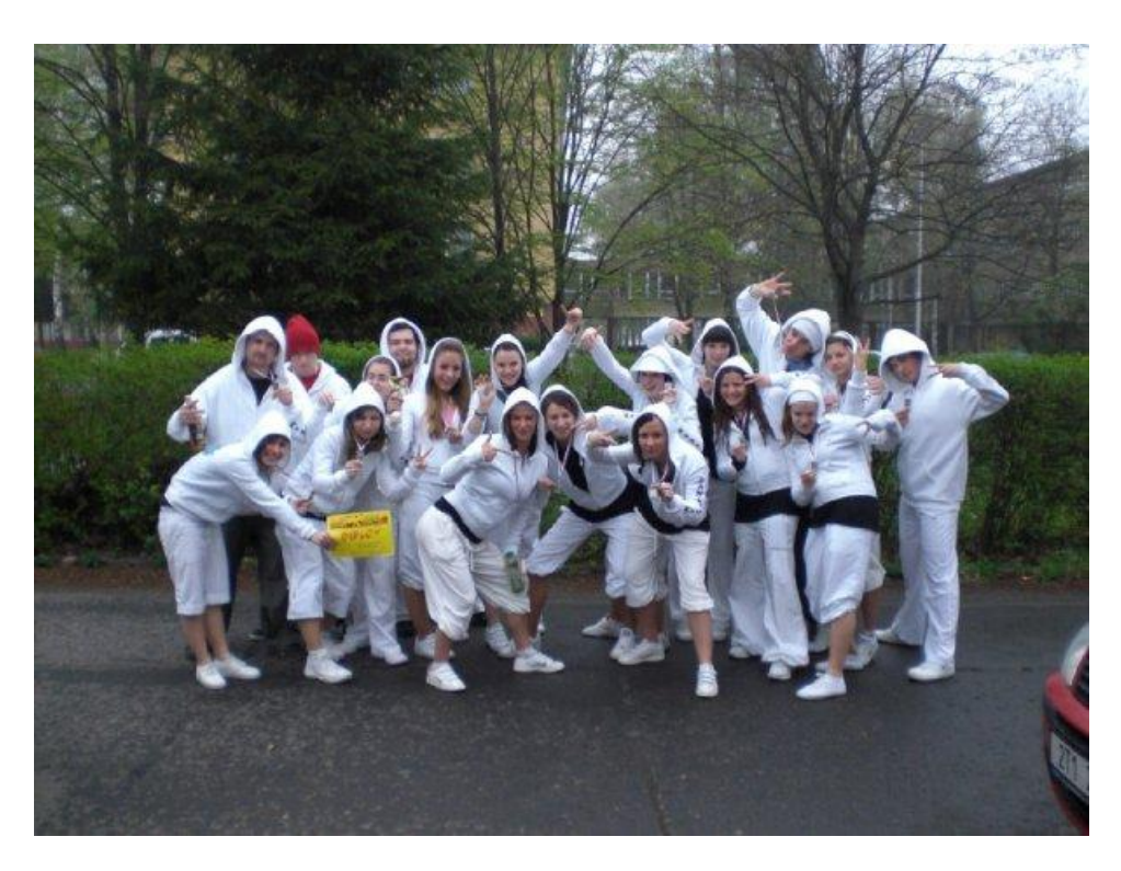
Figure nr. 42 N-yoj Neposlušné tenisky 2008