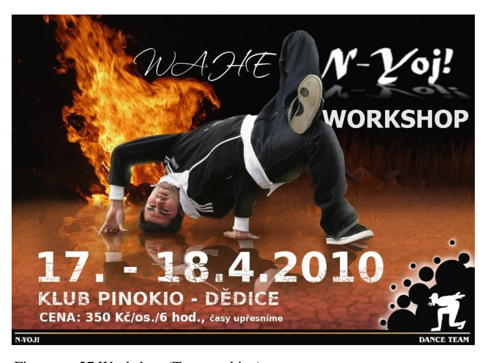
Figure nr. 27 Workshop

"The body is an instrument – music like the metronome and to the body we bang out the rhythm. Dance is about the communication between two. Look to the point and dance to it. Enjoy the way you are. Listen to the music, feel the music, dance the music." Dance for fun! Keep original!" Wahe