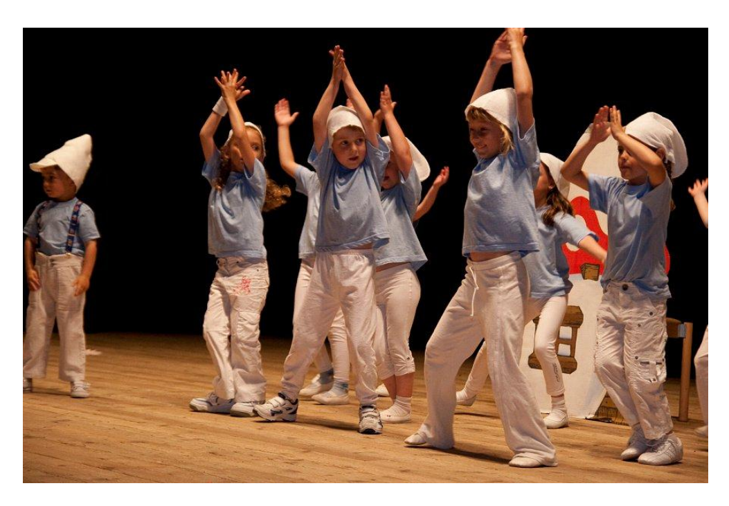
Figure nr. 24 Kids

Children play an important role in the whole structure. They are stretched and full of energy so they adopt the abilities and moves faster. N-yoj Kids used to be divided in two parts but this year they connected to one to reach full staff of approximately thirty people. These pupils train twice a week lectured by Evička and Ajka. Because small children are not so independent lectors have to use quite different methods of education and are supposed to pay special attention.