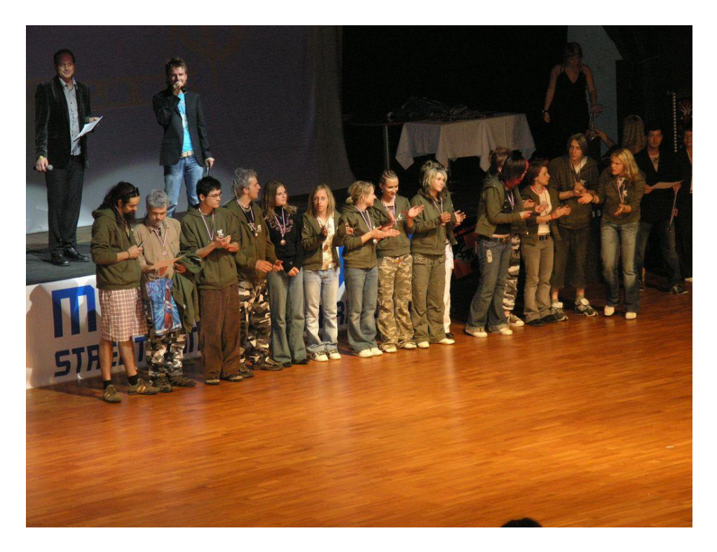
Figure nr. 40 N-yoj Kanjec filma 2006 (Team archive)