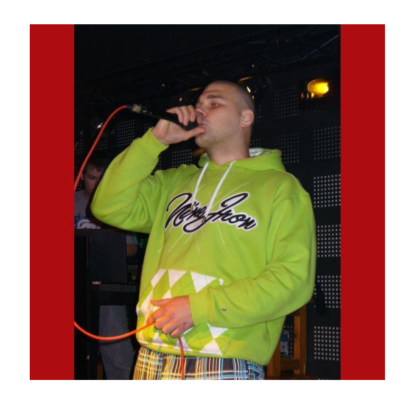
Figure nr. 35 Rapper