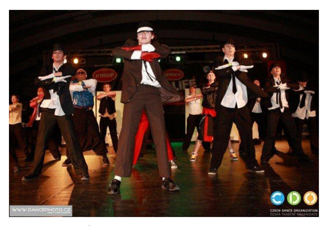
Figure nr. 44 N-yoj Život v muzeu 2010 (Krupička)