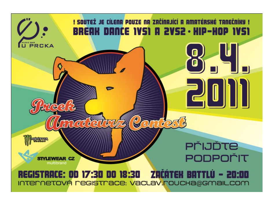
Figure nr. 19 Invitation card (M brijo)