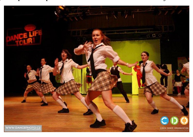
Figure nr. 1 Team photo

Years 2005 and 2006 saw a breakthrough. Thanks to trainings and workshops the Team developed and achieved its first significant success. On the Championship of the Czech Republic N-yoj occupied 3rd place with the formation named "Kanjec filma".