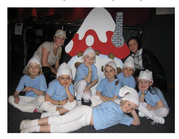
Figure nr. 14 Kids at show

N-yoj Team likes to entertain people and make them happy so the Team started to organise various events. N-yoj show stands for the recapitulation of all the dance performances of the certain year. In June 2010 one hundred people demonstrated together their dance art in "Posádkový Dům Armády Vyškov". This happening was prepared to show the whole year's work in one hour of entertainment and joy. N-yoj show ended with the main choreography "Život v muzeu" (3rd place on EDLT Czech Republic Championship).