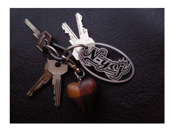
Figure nr. 34 Pendant