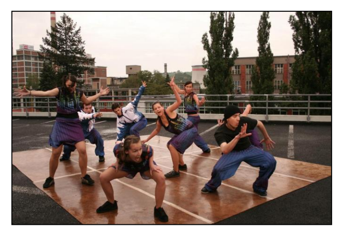
Figure nr. 10 Promo Zlín