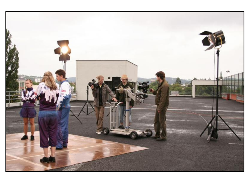
Figure nr. 13 Team photo