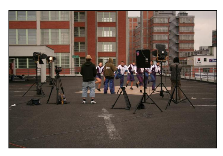
Figure nr. 11 Team photo