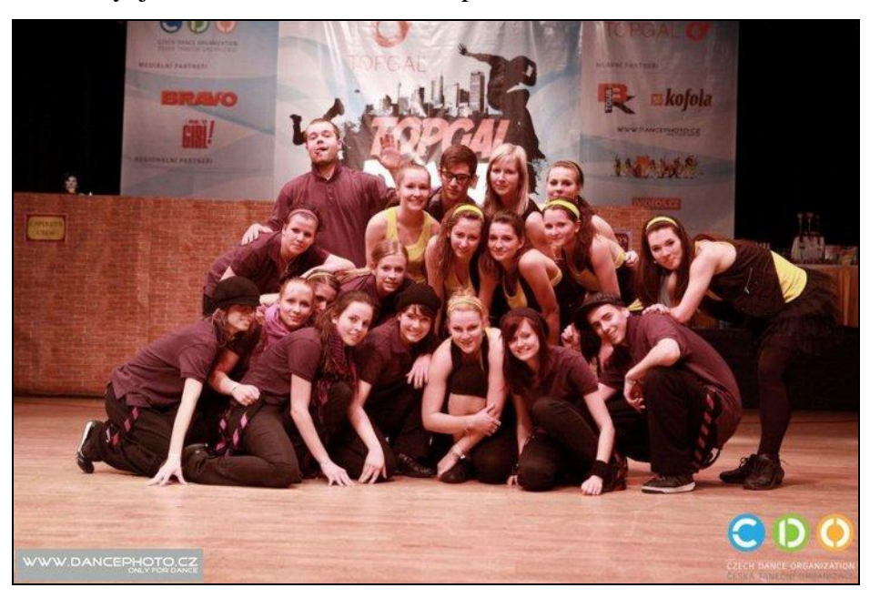
Figure nr. 20 Team photo 2011

N-yoj Dance Team usually competes in the discipline Street show formation — 2nd National League, the main age category. Second league in order to not being forced to pay the membership fees entering to CDO (Czech Dance Organisation). That means that who win this competition is not acting Czech Campion, it is a group who pays the membership in CDO. Fees are voluntary and it does not mean that the paying groups are somehow better. Many of them perform better but not the all. Front Czech groups such as Magic Free Group, High Edition or Mighty Shake Zastávka also competed with N-yoj. Two years old golden medal means great success for Vyškov and It would be better to call best success of N-yoj — 2nd Master of Czech Republic in Street dance 2009.