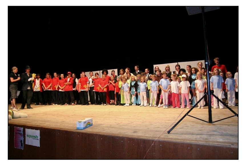
Figure nr. 15 N-yoj Show

This kind of event organised for the first time, and it had surprising attendance and very positive response. Great feedback raised the enthusiasm to make N-yoj show also in 2011. Nowadays the date of the performance is being discussed. There are fourteen performances of N-yoj production which are in the state of preparation (Time is Tickin', Povídky, Chilli, Fakt crew, Kids, Státní maturity, Basketbal, majorettes, Romeo and Juliet,