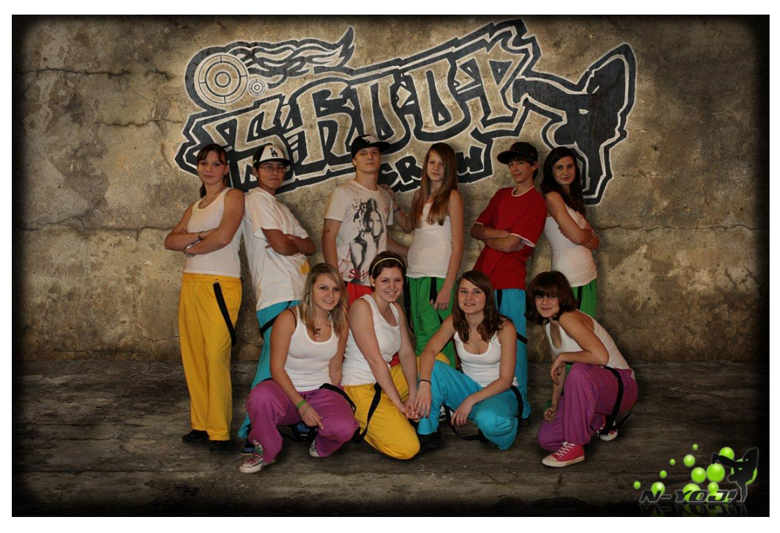
Figure nr. 26 Shoop crew

This group exists since 2010 and represents one of the most emerging part of the Team. Trainings take place twice a week in the gym of Business Academy in Bučovice. Although is this element of N-yoj relatively young dancers show quality performances and great enthusiasm. Shoop crew appears to be one of the fastest growing parts and creates the unit we have to count with. Dancers perform in Bučovice and neighbourhood and sometimes also in Vyškov. They attend various competitions like TOPGAL Czech Championship under CDO (Czech Dance Organisation) and their biggest success is the 1st place on competition in Brno under SUT (Svaz učitelů tance).