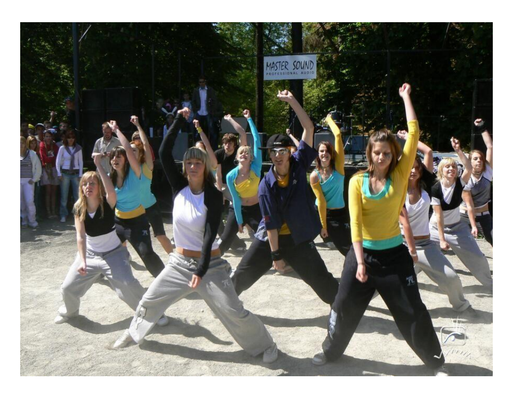
Figure nr. 41 N-yoj Generace 2007