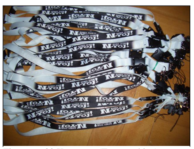
Figure nr. 33 Key cases