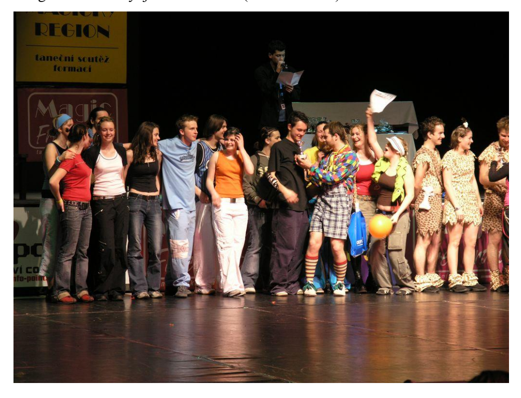
Figure nr. 39 N-yoj Cirkus 2005 (Team archive)