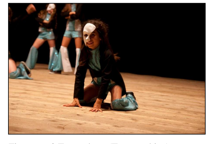
Figure nr. 8 Team photo