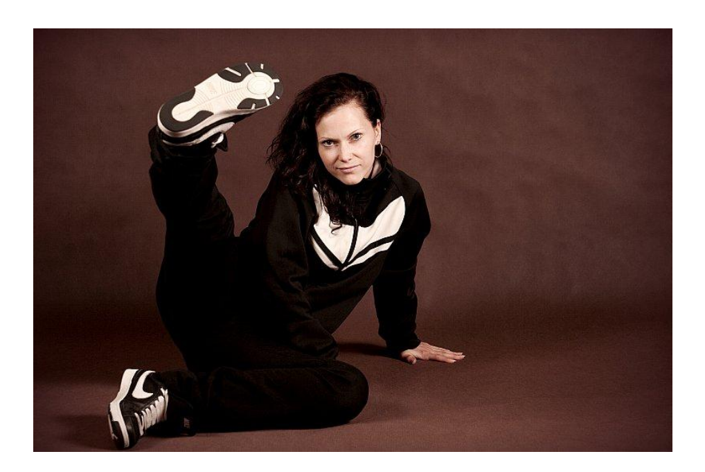
Figure nr. 31 Alča Alyashca Crew(Vinyl)