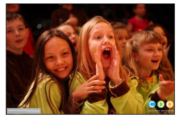
Figure nr. 9 Team kids (Krupička)

There are promo videos in progress which should create a little bit of competiveness in the group because just the best ones are allowed to dance here. Events such as N-yoj show, Christmas party and Prcek Amateur Contest which are mentioned further, are surely good for the team. Speaking about the motivation to dance, there should be mentioned workshops with professional lecturers such as Wahe, Alča or Sanchez.