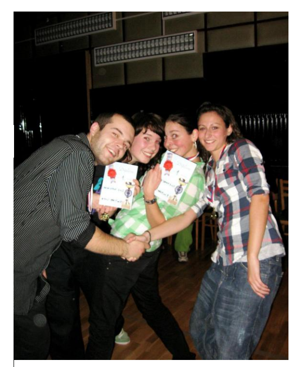
Figure nr. 17 Winners (Team archive)