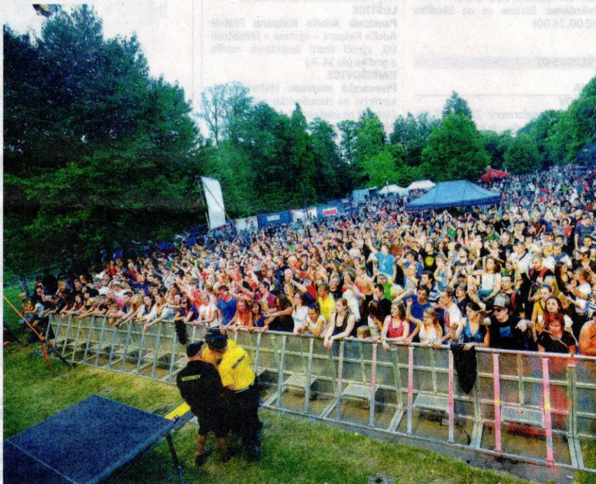
VELKÝ ZÁJEM POSLUCHAČŮ. I letos očekávají pořadatelé festivalu Fingers Up, který se uskuteční po čtvrté, velký zájem posluchačů.

Prosíme výherce, aby vyplnili kupon a celý jej vystřihli. Kupon vymění za vstupenky. Bez něj lístky nedostanou! Děkujeme.