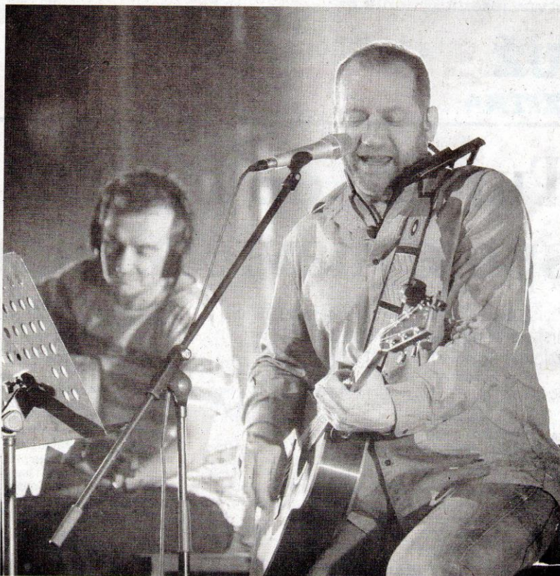
HVĚZDA FESTIVALU. Mezi největší hvězdy, které letos vystoupí na festivalu Fingers Up v Mohelnici, patří i David Koller.

Prosíme výherce, aby vyplnili kupon a celý jej vystříhli. Kupon vymění za vstupenky. Bez něj lístky nedostanou! Děkujeme.