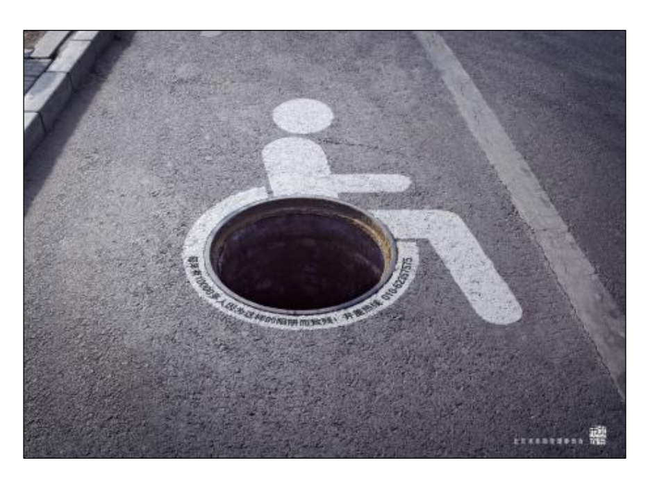
Illustration 3: HellHole

The solution was that 10 manholes around Beijing were marked with handicapped icons and roadblock cones were set up to attract attention. Written in bold Chinese characters was a statistic on the number of people injured every day year as a result of missing manhole covers and hotline number to call for reporting the crime. (Coloribus, 2007)