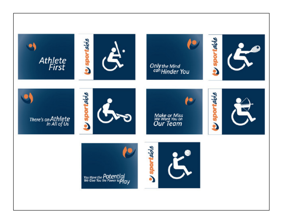
Illustration 3: See Potential, not Disability!

The community "Al Noor Training Centre" which helps children to develop and achieve their potential, has relied on advertising agency Y&R Dubai to create an intelligent and smart urban guerrilla. "The message we want to spread is the awareness that people with disabilities can be productive in their work. The intervention of the guerrilla campaign in the UAE, is one of changing the stickers on classic road signs for people with disabilities, so as to transform the anonymous silhouette of a wheelchair into a musician, athlete, cook..." (Life for All, 2013) Next to the symbol appears "See potential, not disability" to help educate people about the world of disability and invite them to have fewer prejudices.