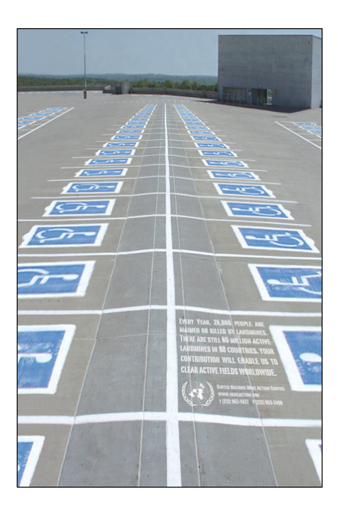
Illustration 2: Handicap

Text on the poster says: "Every year, 26.000 people are maimed or killed by landmines. There are still 80 million active landmines in 88 countries. Your contribution will enable us to clear active fields worldwide."