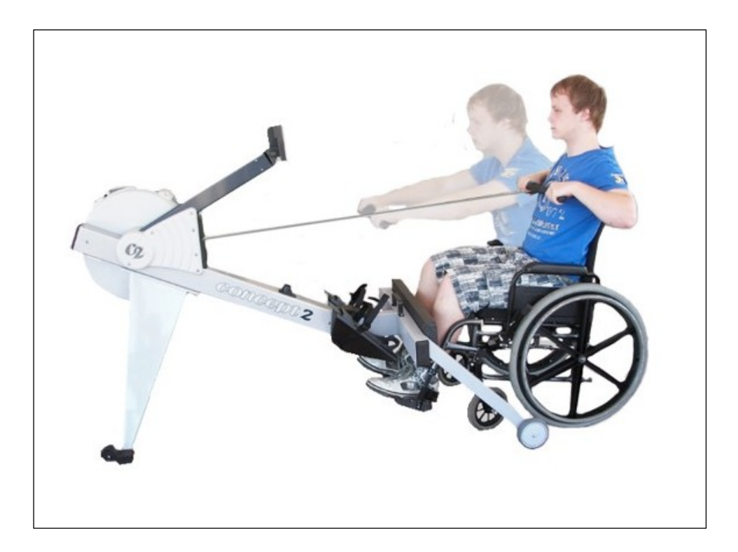
Illustration 6: Concept2 model E with Adapt2Row system

Another Concept2 product is model E rowing machine with Adapt2Row platform that enabled clients to simulate rowing motion. Rowing motion is a good exercise usually for clients who are heavily using hand bikes because rowing motion offset their overused muscles in their upper bodies.