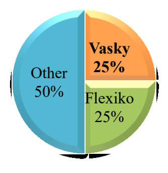
Figure 8 Production until March 2018 (Personal interview)

Returns of investments are fast, and the firm is not slowed down by marketing, the main factor affecting the pace is their production. As was mentioned before Vasky shoes are made by Flexiko, however also products for other companies are produced in the workshop. As shown in the graphs below, until March 2018 Vasky created only 25% out of the whole production. Nevertheless this changed configurator, which was introduced in the same month. Afterwards, Vasky shoes increased up to 50% out of the entire production, because this corresponds to making made-to-order products with higher quality and a wider range of choices offered to the customer. Furthermore, another issue is lack of shoemakers in the workshop, which will be hopefully solved since they have already advertised a job offer. However, for a buyout of Flexiko for expansion of production Vasky shoes, there would not be enough employees and finances so far. Despite the fact that the company is not using subsidy programmes, they are considering this option as well. (Personal interview)