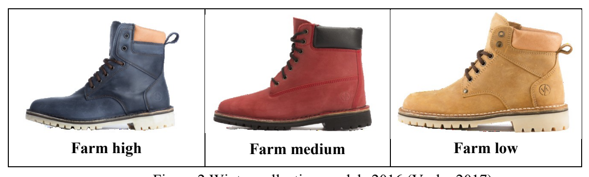
Figure 2 Winter collection models 2016 (Vasky 2017)

This was the first collection dominated by, so called, Farm type of shoes in 3 different variants: high, medium and low. Originally there were much more colourful alternatives to choose from, but only 6 of them have left until present-day. As new collections appear every year with a wide range of products, the older ones are usually reduced. Customers have the option of insulation as well as a thermal insole, which is available for all the winter boots. In case of this collection, the insulation can be textile or natural one (sheep wool), offered sizes are 36–49 EUR. (Vasky 2017)