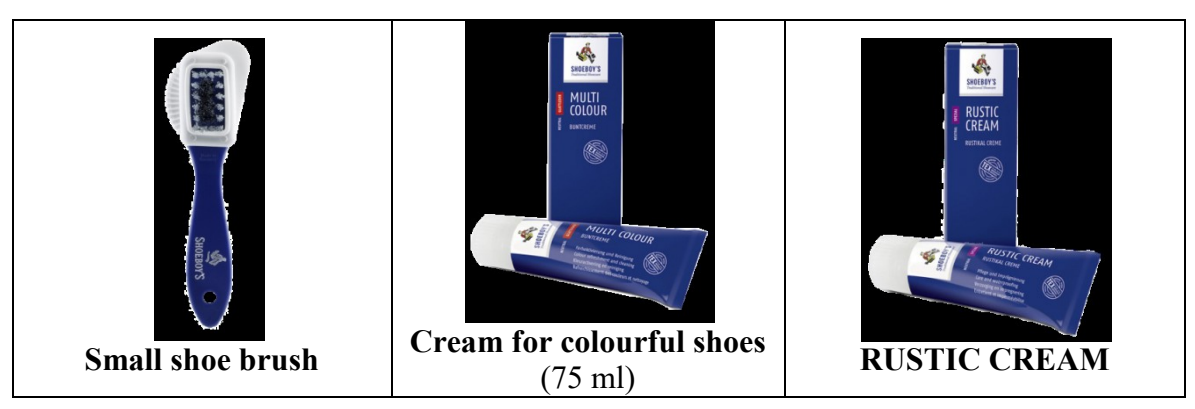
Figure 7 Complements (Vasky 2017)