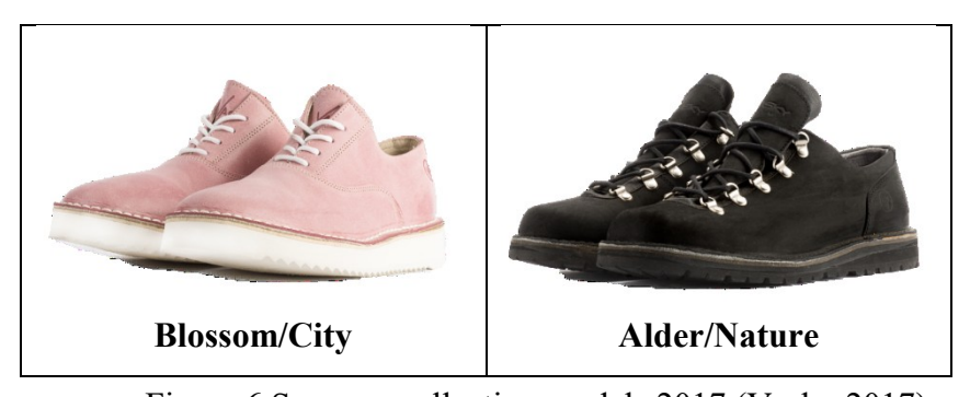
Figure 6 Summer collection models 2017 (Vasky 2017)

Likewise in winter collection 2017, with 2 types of pattern, each of 8 colourful alternatives got own name and story. For this collection, nature variants got apt naming Alder and Oak, while city versions expressed rather a colourful appearance of the shoes with names like Concrete, Cream, Blossom, Skyline, Brownfield, and Shadow. The first mentioned group is available in sizes 36–48 EUR, whereas the second one is offered in sizes 36–47 EUR. (Vasky 2017)