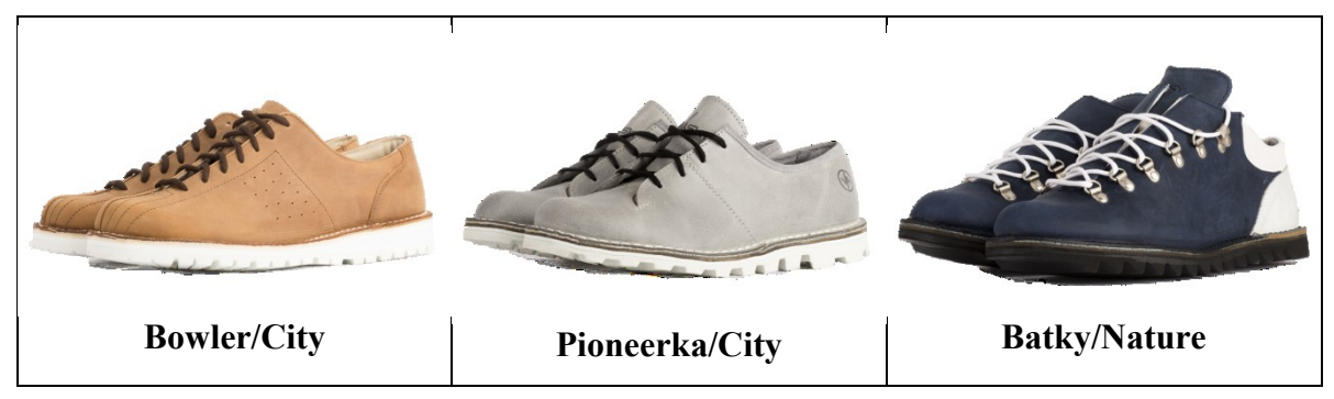
Figure 5 Summer collection models 2016 (Vasky 2017)

traditional type Pioneer offered in sizes 36–48, Batky probably named after Bata in sizes 36–47 EUR. (Vasky 2017)