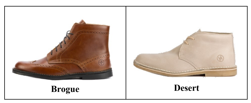
Figure 4 Winter collection models 2018 (Vasky 2017)

The most recent winter collection introduced 2 types of shoes in 16 colourful alternatives. Moreover, there is not directly specified classification in categories the city or nature, however from the appearance of the outsole it is visible that boots rather match the city style. Compared to winter 2017, only 2 stories are corresponding to the same number of designs. The Brogues are inspired by work shoes of the same name, which later became popular boots with businessmen. Likewise known are the Desert Boots initially made as military shoes used in a desert, then worn by celebrities. In this collection is absent option of natural insulation (sheep wool) and available sizes are 36–44 EUR. (Vasky 2017)