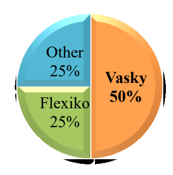
Figure 9 Production from March 2018 (Personal interview)