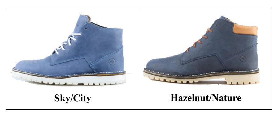
Figure 3 Winter collection models 2017 (Vasky 2017)