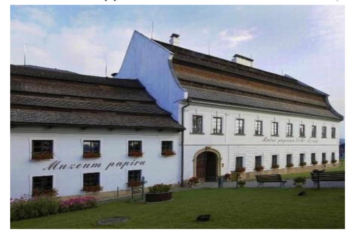
Picture 2 Handmade Paper Mill Velké Losiny (Ruční papírna Velké Losiny 2014)

While the vest majority of handmade paper mills were replaced by machine production, paper mill Velké Losiny still uses the original and for centuries proven manufacture uninfluenced by new technologies. Handmade paper is primarily made of cotton, linen and cannabis. They also produce products made of handmade paper, occupy themselves with publishing, graphical work and printing production. Nowadays are in Czech Republic about 20 paper factories but they do not follow traditional procedures so they are not handmade paper mills. According to world databases in the world there are around 3000 handmade paper mills and around 2800 of them are situated in Asia. (Ruční