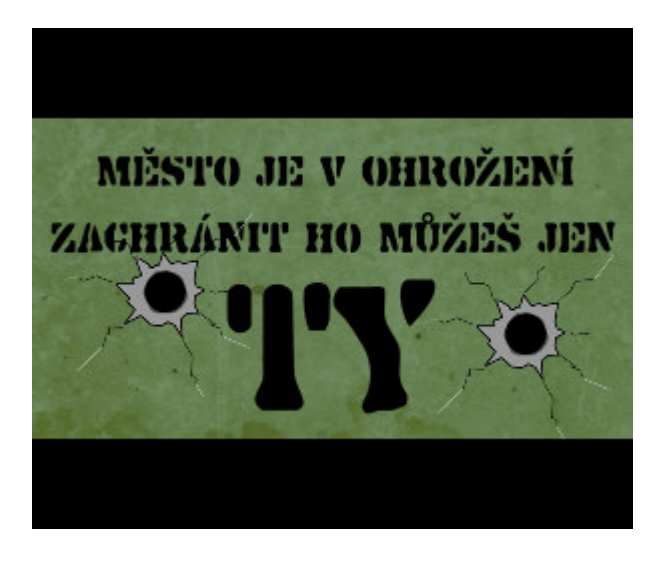
Picture No.14 – Město je v ohrožení, zachránit ho můžeš jen ty! (City is in Danger, only you can save it!)

Spustit Super Defender (Start Super Defender)