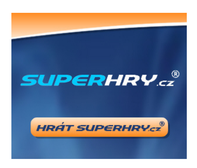
Picture No.11 – Hrát Superhry.cz<sup>®</sup> (Play Superhry.cz<sup>®</sup>)

All used banners have the dimension 300 x 250 pixels and JPG image format. The first simple basic brand building banner is includes only a logo of Superhry.cz<sup>®</sup> and a orange button Hrát (Play) Superhry.cz<sup>®</sup>. This button should motivate potential players to click on it, "super hry" means "super games" in Czech. The visitors association should be that all games on portal Superhry.cz<sup>®</sup> are super. Superhry.cz<sup>®</sup> is Registered Trade Mark. The design, color and style correspond with corporate identity of portal.