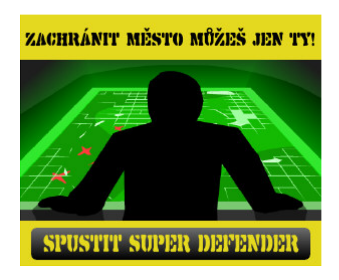
Picture No.13 – Zachránit město můžeš jen ty! (Only you can save the city!)

Spustit Super Defender (Start Super Defender)