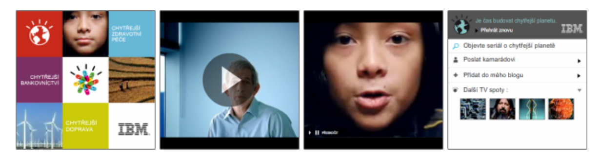
Picture No.7 – Short storyboard of video banner "IBM Smarter Planet"

A very good example of a sophisticated video banner advertisement is "IBM Smarter Planet". The banner's size is 300 x 300 pixels and video is plays automatically without sound. However, and sound will start when a visitor mousse over the banner.