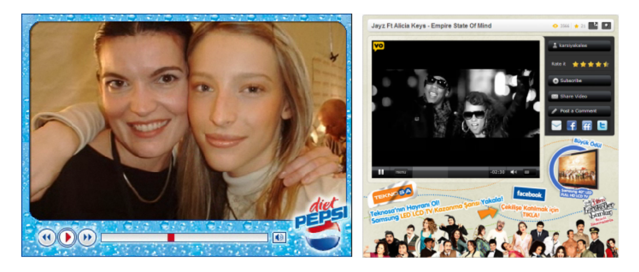
Picture No.1 – Branded video player and branded video player surroundings

colors and design. It is common for brands to dress up whole web pages or the video player surroundings. Brand and advertising messages are very visible for visitors and unmissable on particular websites.