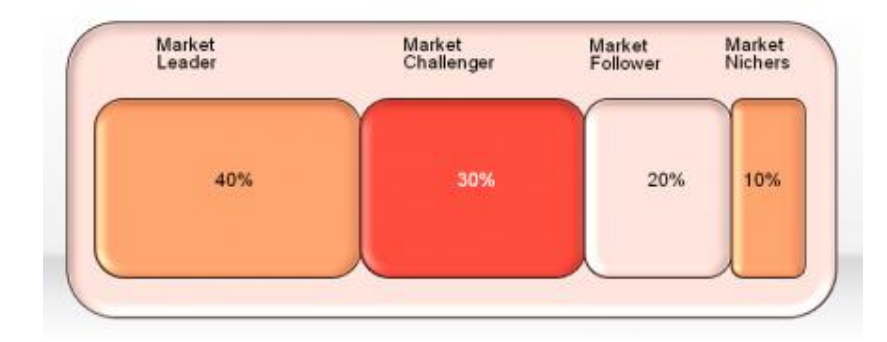
Figure 2. Hypothetical Market Structure, accessed January 13, 2014, http://drawpack.com/.

According to Kotler et al. (2005, 503-505), there are four different positions at the market, into which a company can be included. These are: market leader, market challenger, market follower or market nicher.