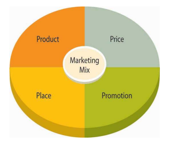
Figure 3. Marketing Mix, accessed January 14, 2014, http://2012books.lardbucket.org/.

According to Kotler's definition marketing mix is "the set of controllable tools – product, price, place and promotion – that the firm blends to produce the response it wants in the target market" (Kotler et al. 2005, 34). The tools are better known as Four Ps. These Four P's are considered as tools of sellers. Nowadays when companies are oriented more towards customers, some experts suggest replacement of Four P's with Four C's. Four C's contain customer needs and wants, cost to the customer, convenience and communication (Kotler et al. 2005, 34; McClean 2012).