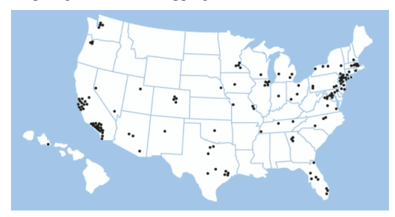
Figure 10. Apple's U.S. Retail Store Locations, accessed February 8, 2014, http://macdailynews.com/.

In the case of iPhone on the U.S. market, as stated above, the product was available at the Apple online store on the www.apple.com website and also via the retail stores of AT&T and Apple. In 2007, at the time when iPhones went on sale, Apple had about 178 retail stores worldwide (Ifo Apple Store 2007) but most of them were in the United States as visible at Figure 11 below. Regarding the venues of the stores, as Kahney (2009, 195, 200-201) states all the stores were situated at prime locations which are expensive but there is the largest concentration of people. Over time the Apple's retail stores have proven to be very profitable. One Apple store earns more money than larger stores or several small shops together in one shopping center.