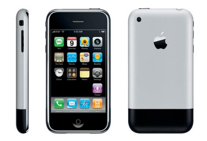
Figure 6. iPhone 1<sup>st</sup> Generation, accessed February 7, 2014, http://cdr.cz/.