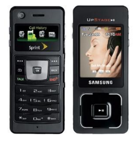
Figure 8. Samsung Upstage, accessed February 8, 2014, http://buymytronics.com/.

In September 2007, only two months after iPhones began to be sold, Apple announced lowering of the price of 8GB model from $599 to just $399, hence even more customers could afford it. The 4GB model expected to be available to its sellout (Apple 2007). Regarding iPhone competitors, there were many music phones that could potentially beat the iPhone. It was especially because these phones were much cheaper. These were for instance LG Muziq, LG Chocolate, LG Prada, Sony Ericsson's Walkman phones, Samsung Upstage or Nokia N95, the only model which was more expensive than iPhone (Carew 2007).