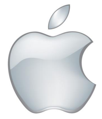
Figure 5. Apple Logo, accessed January 22, 2014, http://bigfatuniverse.blogspot.cz/.