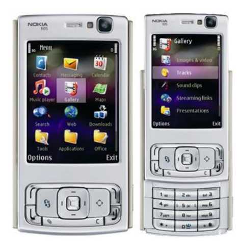
Figure 9. Nokia N95, accessed February 8, 2014, http://symbian3rd.tym.cz/.