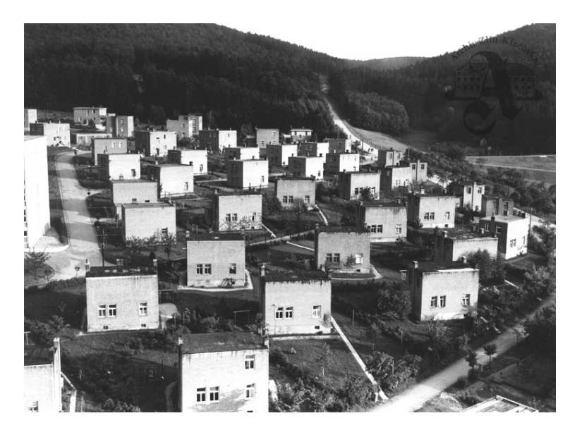
Figure 2. Dwellings in Nad Ovčírnou quarter, "Galerie: Architektura," Informační centrum Baťa, accessed April 30, 2021, http://tomasbata.org/galerie/.

The goal of an urbanistic plan developed by Kotěra and adjusted by Gahura was to convert Zlín into a city in gardens. As a part of it, a new center of social life, Náměstí Práce, was constructed. Dormitories, a market hall, department store, community hall, and grand cinema attracted people to spend their free time there. The establishment of a cemetery in a forest on the southern edge of Zlín was a part of this plan, as well as brand new city districts of Díly and Lazy, and the city castle became accessible for ordinary people. This plan was designed for a capacity of 100,000 inhabitants<sup>52</sup>, however, the number was never reached.