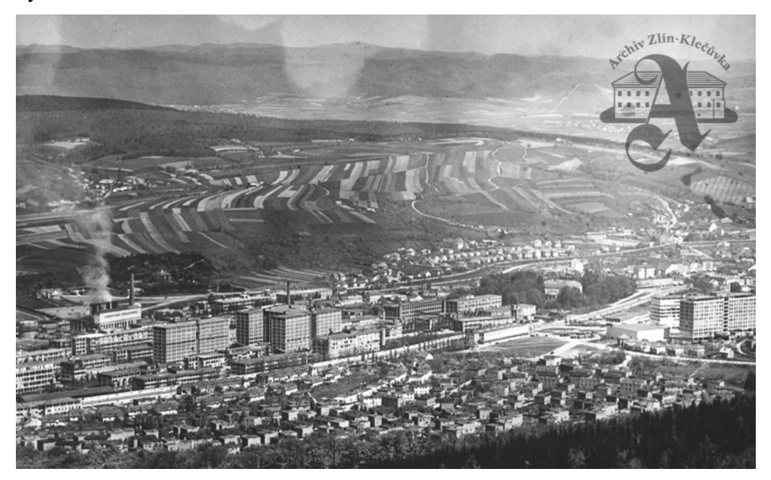
Figure 3. Factory complex and residential areas in 1936, "Galerie: Architektura," Informační centrum Baťa, accessed April 30, 2021, http://tomasbata.org/galerie/.

to approximately 40,000 inhabitants. More than half of them were employees of the Bata business. The majority lived in the dwellings constructed by the company. The city was seen as a modern industrial town that allows its residents to spend their free time in parks, gardens, surrounding forests, shopping, participating in sports activities, and relaxing. This unique concept connected the plant with city life and the surrounding ubiquitous greenery. Furthermore, a place of relaxation and education became a small ZOO established in 1930. And after four years, it was moved to woods further from the city center. However, there was a lack of food for the animals during the Nazi occupation, and the ZOO had to be shut down in the 1940s. In 1944, the city introduced a new type of urban transportation solution: trolleybuses and buses. <sup>55</sup>