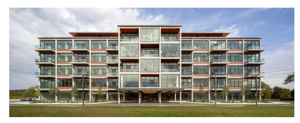
Figure 8. Remodeled factory building, Scott Notsworthy, "Bata Shoe Factory, Batawa, Ontario," Canadian Architect , September 29, 2020, https://www.canadianarchitect.com/bata-shoe-factory/.

In 2007, the community consisted of 110 houses with more than 300 inhabitants. The housing part consisted of bungalows in private ownership and a retirement home with 11 accommodation units. The residents could take advantage of a Catholic Church, a Catholic elementary school, a community center, a fire hall, and the Inwar Manufacturing plant. As the primary employer in the area, it employed 400 people. In 2019, the number of residents remained similar as in 2007, but approximately 20 new dwellings were constructed. The increase in the number of residents is expected as a result of the Plan of Sustainable Development of Batawa. Page 110 houses with more than 300 inhabitants. The