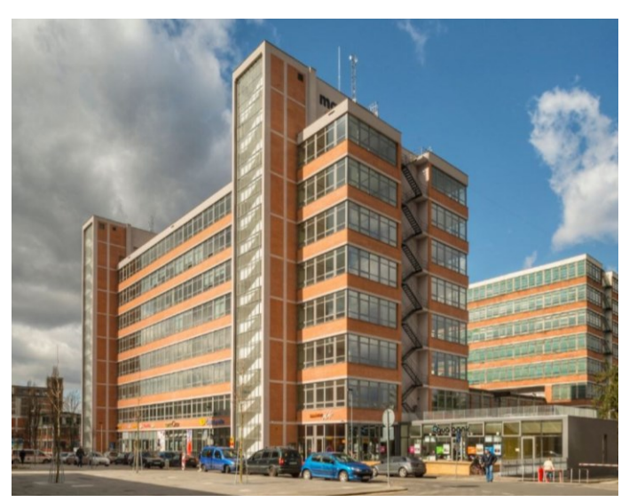
Figure 4. Former factory building remodeled into a multi-purpose building, "O budově," max 32, accessed April 30, 2021, http://www.max32.cz/cs/o-budove.

70% of Zlín is protected as a conservation area for its history and uniqueness. Thus, when remodeling Bata houses or factory buildings, the original visual aspect must be kept in mind. The skyscraper is currently used as an administration building consisting of offices that belong to the regional authorities and tax department. This building is a well-liked destination for both tourists and locals for its lookout on the top floor. Across the street, there is a multi-purpose building that offers lofts, office space, post office, bakery, fitness center, etc. Buildings number 14 and 15 were converted into the regional library, museum of shoes, and an art gallery. <sup>62</sup>