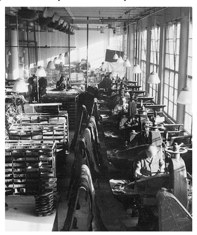
Figure 1. Interior of a factory building in Zlín

The plant, a focal point of Zlín, consisted of multi-story factory buildings which allowed a lot of natural light inside the open-spaced workshops. Its workers were taught how to use shoe-manufacturing machines and produce millions pairs of shoes anually.<sup>49</sup>