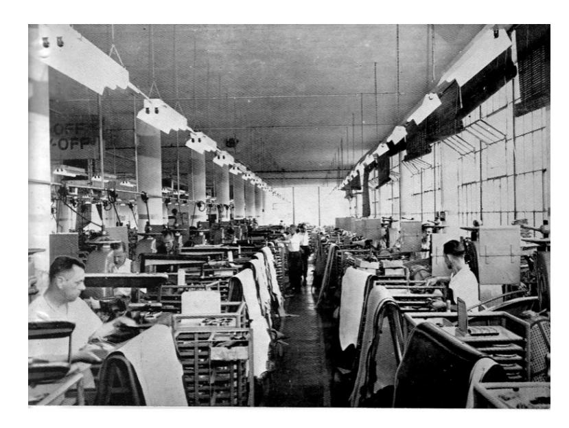
Figure 6. Interior of the Batawa factory, "Batawa Photo Gallery: History," Batawa Development Corporation, accessed April 30, 2021, https://batawa.ca/photo-gallery-s16.php?limit=36&cap=18&photoAlbumID=2#&gid=1&pid=15.

The big windows were not the only feature brought from Europe. There was also the innovation of the concrete slab.<sup>83</sup> The concrete waffle structure was used while constructing large spaces to achieve rigidity and solidity of the buildings.<sup>84</sup>