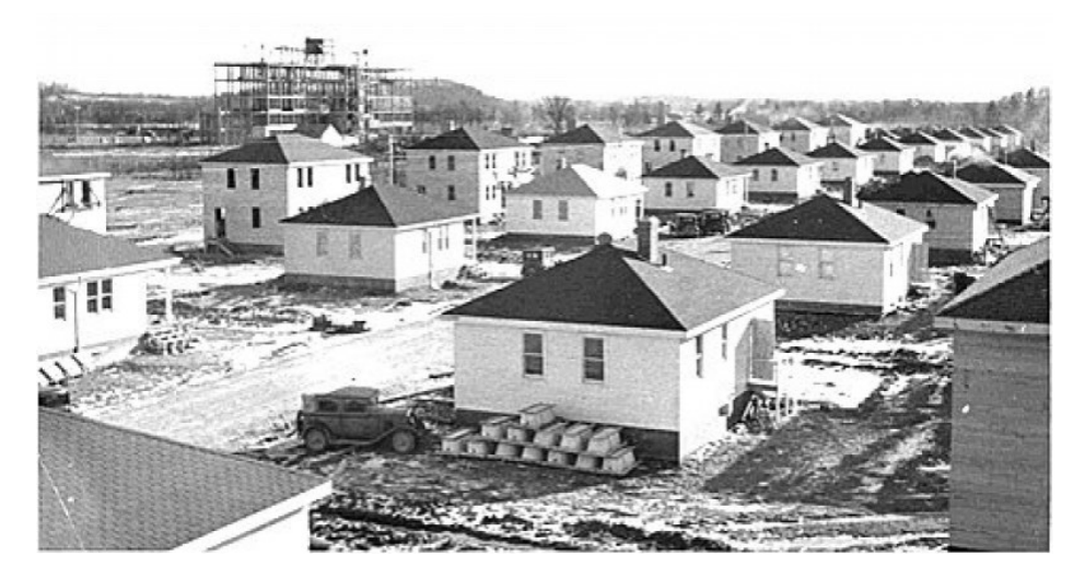
Figure 7. Single-family and double-family dwellings of Batawa, "Batawa Photo Gallery: History," Batawa Development Corporation, accessed April 30, 2021, https://batawa.ca/photo-gallery-

The first dwellings of Batawa were wooden single-family bungalows and double-family two-story homes. Construction began in autumn of 1939. Both types of utilities included a kitchen, a bathroom, a living room, and two bedrooms.<sup>87</sup>