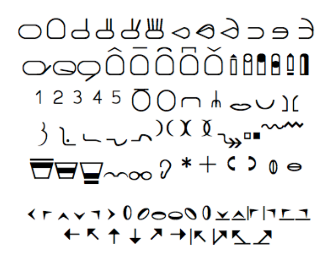
Figure 3 - HamNoSys

Nowadays still popular writing system that has gone through four amendments and was developed in 1985 at the University of Hamburg and therefore is named Hamburg Notation System, or HamNoSys. Yet again this writing system was not designed for a particular sign language but can in fact be used to capture any sign language in the world. It partially offers "non-manual features" (facial expressions, body language). However, full sentences cannot be captured with HamNoSys.<sup>48</sup>