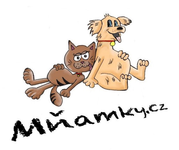
Figure 1: Company's logo (own creation)