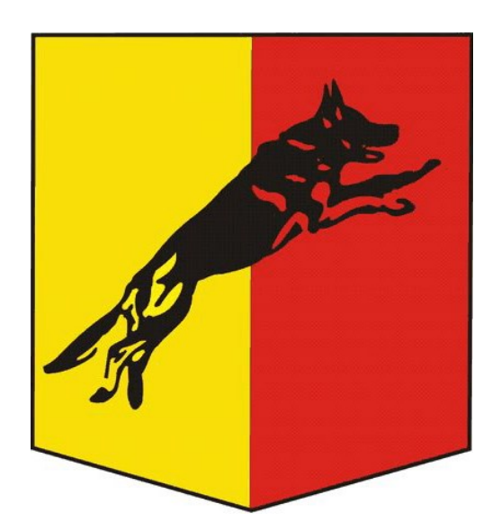
Figure 6 – Logo of the Police of the Czech Republic's Cynology (Logo kynologie PČR, 2024)

Dogs are prepared for all-round and specialist training. Dogs are certified in a particular category after completing the course and meeting the examination requirements. (Odbor služební kynologie a hipologie, 2024)