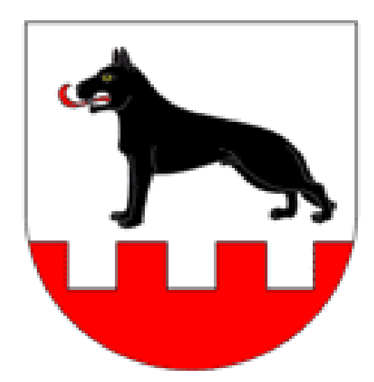
Figure 4 – Emblem of the Military Cynology Center in Chotyně (Znak VKC - Chotyně, 2024)

The Center of Military Cynology is a highly respected institution within the Military Healthcare Agency of the Army of the Czech Republic. Its primary focus is providing comprehensive education and training in military cynology to all members of the Ministry of Defence and the Castle Guard. Through interdepartmental contracts and agreements, it extends its services to other ministries with the goal of preparing them for participation in foreign operations. (Andrej Vítek: Výběr, výcvik a péče o psy určené pro službu u vojenských jednotek, 2021)