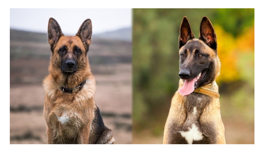
Figure 2 – German Sheperd (left), Belgian Malinois (right) (German Shepherd vs. Belgian Malinois: Comparing Two Confident Breeds, 2022)