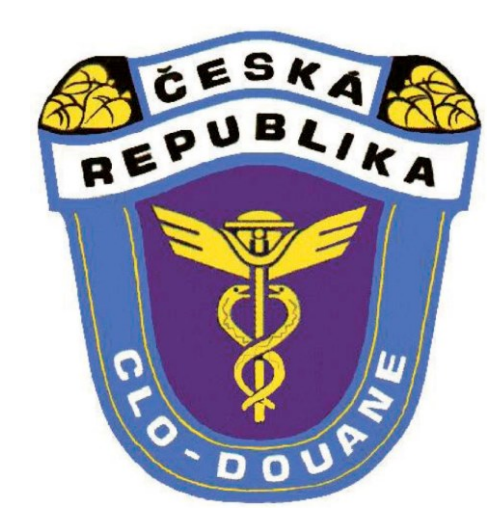
Figure 5 – Customs Administration logo (Logo Celní správy ČR, 2024)