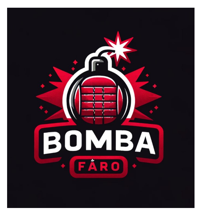
Figure 2: Logo