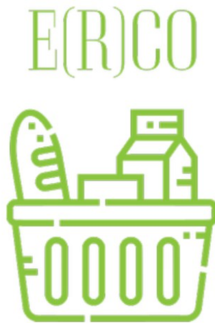
Figure 1 Logo of the company (own creation)