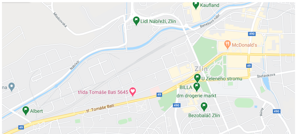
Figure 2 Distance of Competitors (Google Maps 2020)

The Figure 2 shows the direct competitors and their position (market in the green colour) as compared to the location of the planned business (marked in the pink colour).