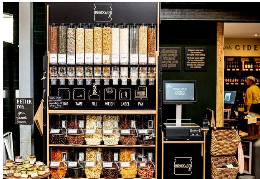
Figure 3 The Design of the Shop (Unpacked 2020)

black, brown, beige and with a few details coloured in baby blue and yellow. The design of the shop is shown in the Figure 3 .