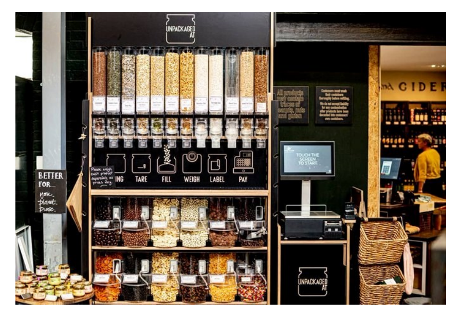
Figure 3 The Design of the Shop (Unpacked 2020)

black, brown, beige and with a few details coloured in baby blue and yellow. The design of the shop is shown in the Figure 3 .