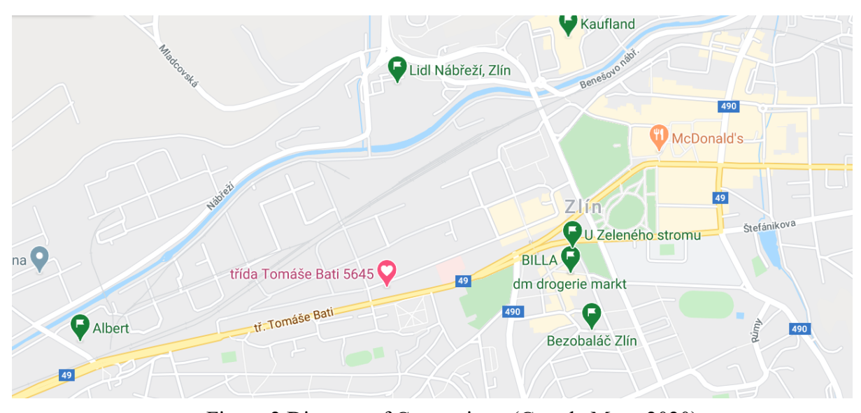
Figure 2 Distance of Competitors

The Figure 2 shows the direct competitors and their position (market in the green colour) as compared to the location of the planned business (marked in the pink colour).